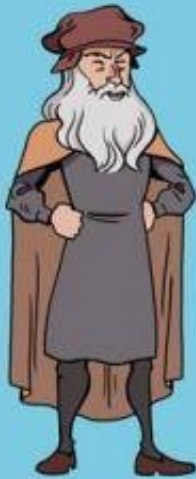
LEONARDO DA VINCI