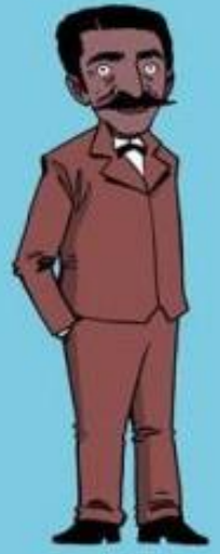
GEORGE WASHINGTON CARVER