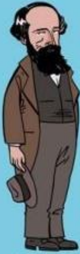
JAMES CLERK MAXWELL