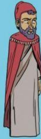
GALEN OF PERGAMON